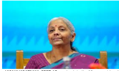
VISAKHAPATNAM, SEPT 17

Union Finance Minister Nirmala Sitharaman on Wednesday said the next generation GST reforms will infuse Rs 2 lakh crore into the economy, leaving people with more cash in hand that otherwise would have gone as taxes.