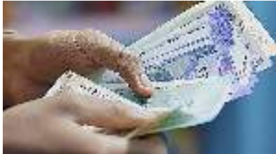
MUMBAI, SEPT 17

The rupee appreciated 25 paise to close at 87.84 (provisional) against US dollar on Wednesday, tracking a positive trend in domestic equities and supported by optimism over US-India trade negotiations.