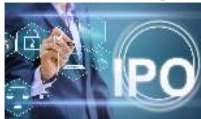
NEW DELHI, SEPT 17

Atlanta Electricals Ltd, manufacturer of power, auto and inverter duty transformers, on Wednesday said it will launch its initial public offering (IPO) on September 22 to raise Rs 687 crore.