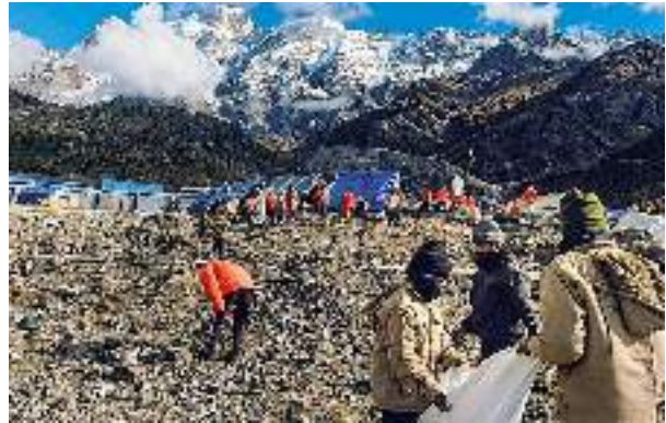
Sanitation workers, along with the district administration and police personnel, take part in a cleanliness drive at Kedarnath Dham as part of the 'Swachhata Pakhwada' campaign, organised by Sulabh International Social Service Organisation, in Rudrapur district, Uttarakhand.

"The Juvenile Justice Board or the magistrate (juvenile justice) the place where Master K would stay with his father in the future shall oversee and monitor the physical and psychological well-being of Master K through the Child Welfare Committee or any social welfare officer available within the district," it said.