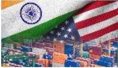
NEW DELHI, SEPT 17

India's exports to the US are falling as high tariffs imposed by the Trump administration have started eroding the price competitiveness of domestic goods in Washington, think tank GTRI said on Wednesday.